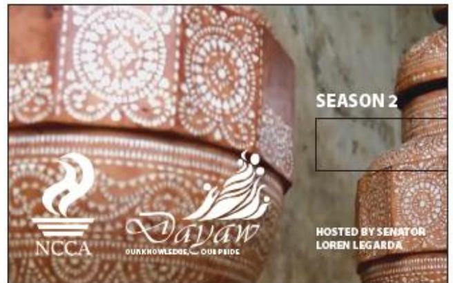
USB Card front layout