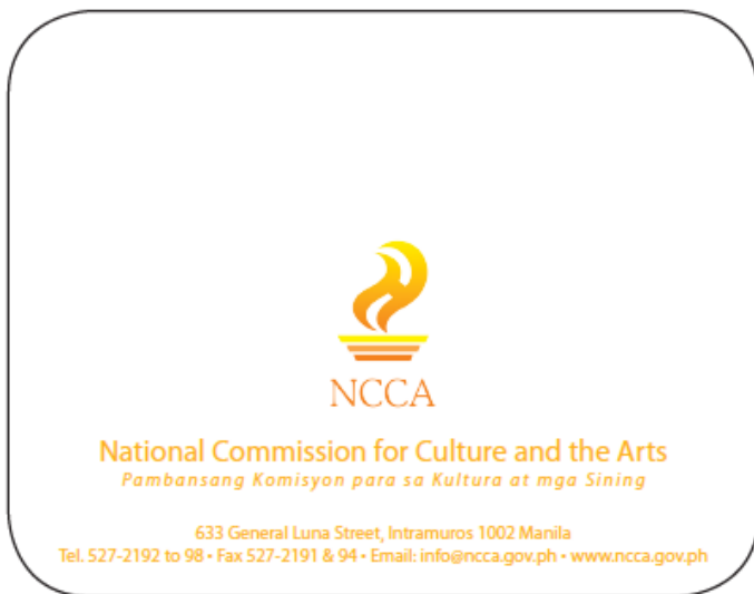
Packaging bottom layout (applies to all packaging)