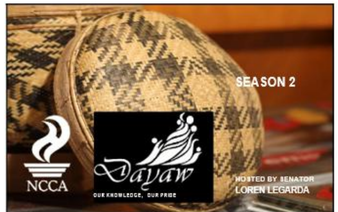
USB Card front layout