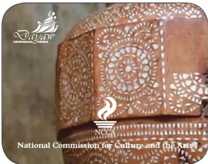
Packaging front cover layout