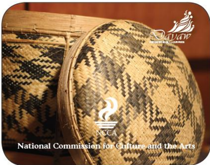
Packaging front cover layout