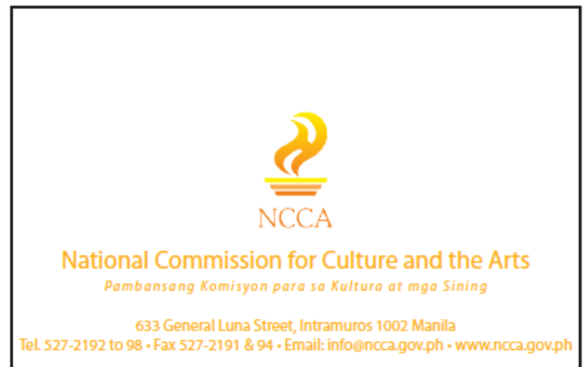
USB Card back layout (applies to all USB Card)