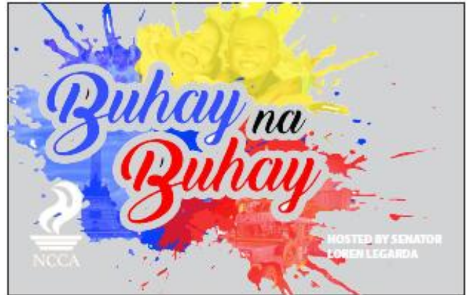
USB Card front layout