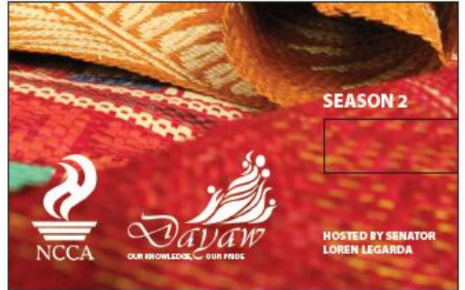
USB Card front layout