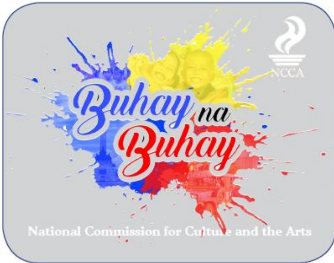
Packaging front cover layout