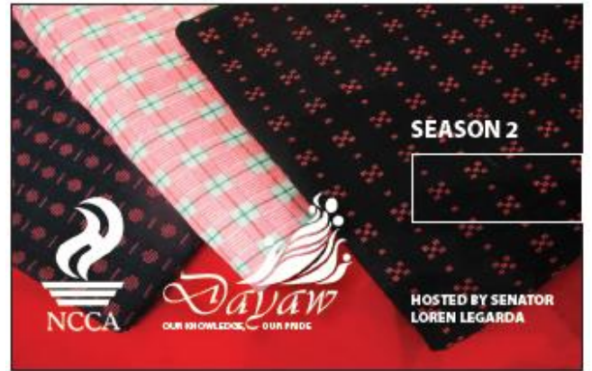
USB Card front layout