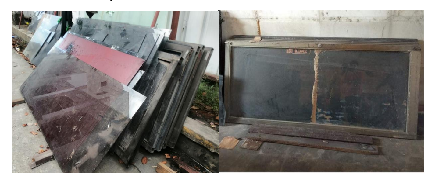
Metal scraps & metal grills